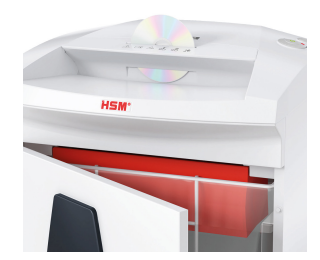
A separate collecting bag means that the shredder material can easily be sorted and separated for correct recycling.

The induction-hardened, solid steel cutting rollers with a lifetime warranty can easily cope with staples and paper clips and guarantee durability.