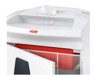
A separate collecting bag means that the shredder material can easily be sorted and separated for correct recycling.

The induction-hardened, solid steel cutting rollers with a lifetime warranty can easily cope with staples and paper clips and guarantee durability.