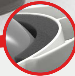
Soft forehead pad (15mm)