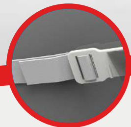
Easy to adjust for a perfect fit