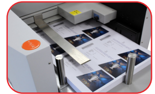
Deep pile feeder